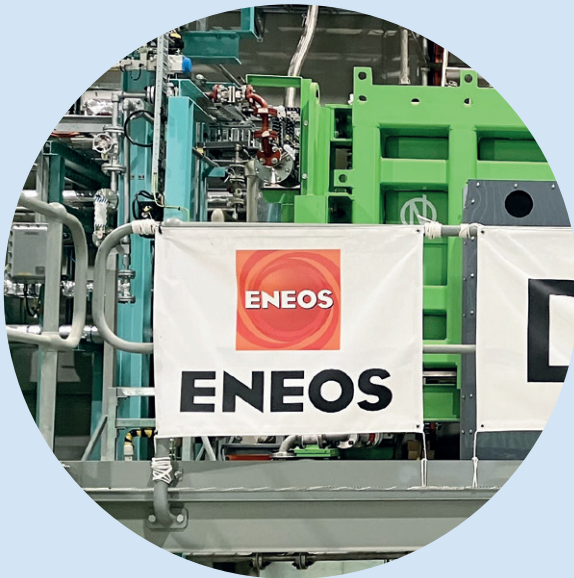
2023 ENEOS plant opening

In 2022 ENEOS developed a demonstration plant in Brisbane and using its proprietary low-cost “electrochemical synthesis of organic hydride” method, was able to produce methylcyclohexane (MCH), a liquid carrier of hydrogen which is stable at atmospheric pressure and temperature. The opening ceremony was held 30 January 2023 and the plant began operating the following month.