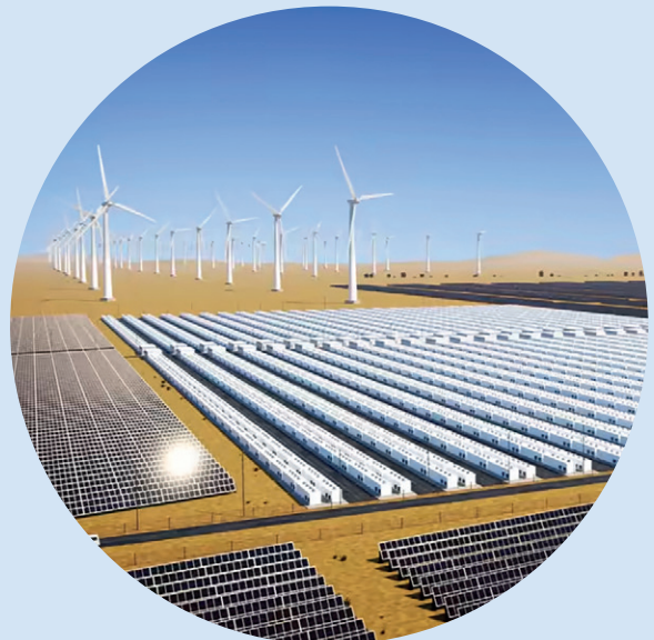
ENEOS' commercial-scale plant vision

Additionally, we are providing operational advisory services during the detailed design phase with a focus on technical safety, process optimisation, fit for purpose operations and maintenance outcomes and OPEX minimisation. These will be achieved by implementing industry best practices, which is especially important with new technology. When the project enters the construction phase, GRPS will be responsible for commissioning and operational readiness as well as assurance activities.